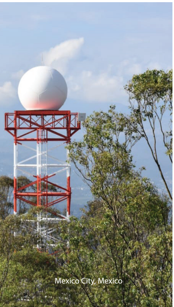
Mexico City, Mexico